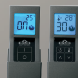
OPTIONAL REMOTE CONTROL