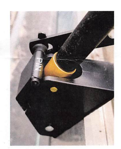
SET SCREW #2 (HIGHLIGHTED IN YELLOW)

STEP ONE: ATTACH SET SCREWS TO ATTACH CYLINDER & MOUNTING BRACKET.