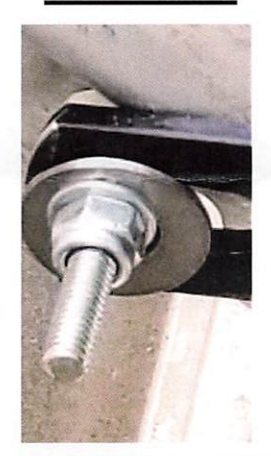
#4 x 1" METRIC BOLT W/ WASHER, 1/4" WASHER NUT, & LOCK NUT.