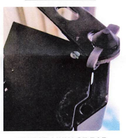
PIN FOR LINKAGE BAR CONNECTION (MAKE SURE PIN IS ATTACHED IN THE TOP HOLE.)