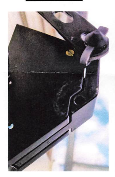
SET SCREW #1 (HIGHLIGHTED IN YELLOW)