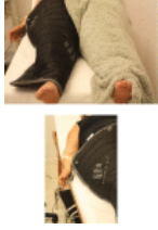
Figure 1 Patient undergoing PEMF therapy (right...