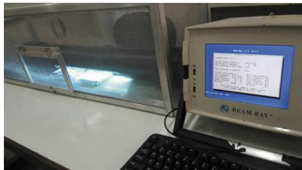
Figure 2. The pulsed electromagnetic field system where the Ar-filled plasma tube is placed inside a Faraday aluminium cage with the microwell plates 2.5 cm below the plasma tube.

methodology of preparing the breast cancer cell samples was modelled using perfusion techniques already prepared by the Molecular Science Unit of De La Salle University, Philippines. In essence, the samples used were a replication of the in vivo phenotype. These samples were equally placed in each well of five 96-microwell plates (8 rows×12 columns) – four for the treatment group and one for the control group – with 25 \mu l of cells placed in each well at approximately 70% confluence. The cells to be treated with PEMF were placed inside a mesh or Faraday cage that was targeted by modulating resonant frequency propagated by a 3.3 MHz carrier frequency. To minimise collateral exposure of the neighbouring samples, aluminium foil was placed on the microwell plate to cover it, as shown in Figure 1.