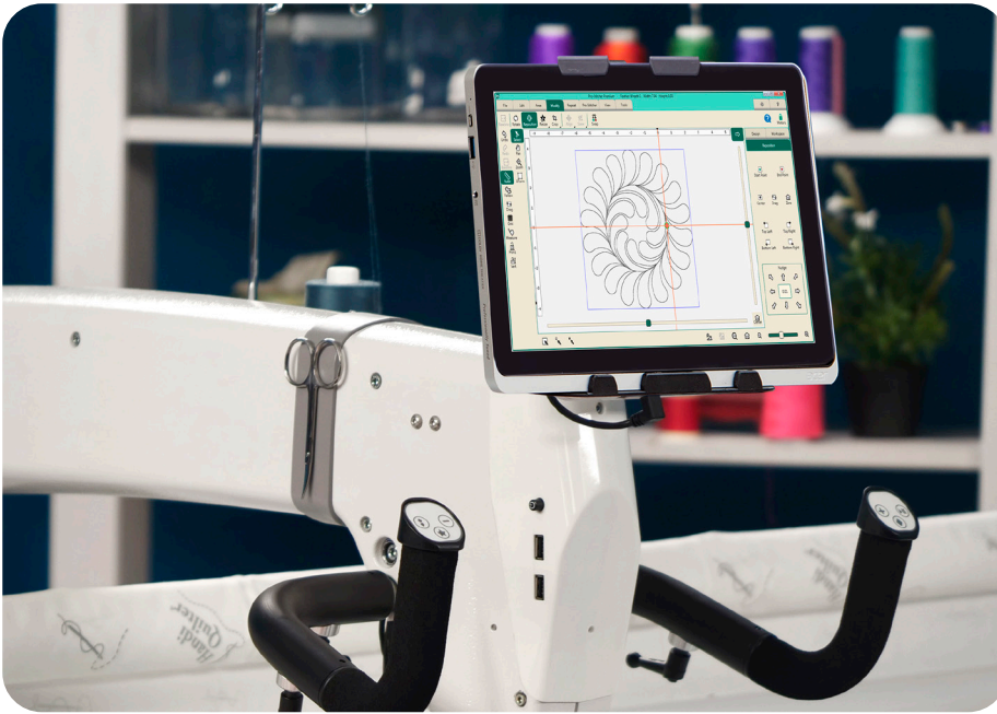
Pro-Stitcher Premium shown on one of many compatible machines.