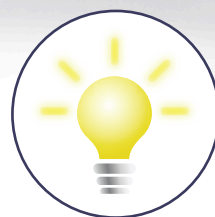
QuiltMaster TM LED lighting: throat, needle, and bobbin