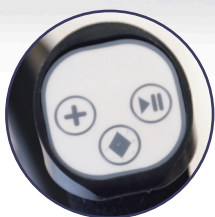
Independently adjustable handlebars with programmable buttons