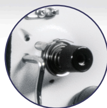
Easy-Set Tension TM