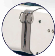
Magnetic tool minder collar