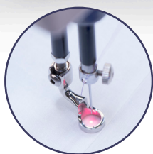
Pinpoint needle laser