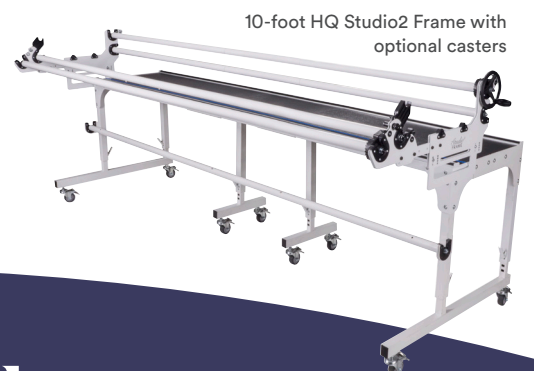
10-foot HQ Studio2 Frame with optional casters

The Amara 20-inch longarm machine with HQ Studio2 TM Frame (choose from 10-foot or 12-foot). Everything you need for free-motion quilting right out of the box, including a powerful, Handi Quilter stand-alone bobbin winder.