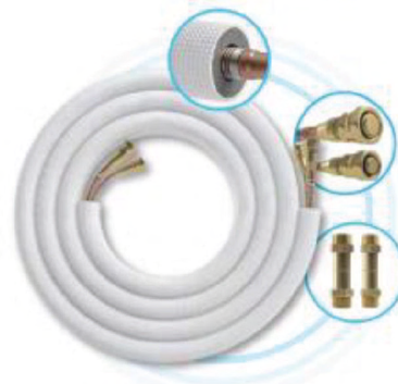
Pre-Charged Line Set