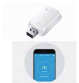
Wi Fi Control