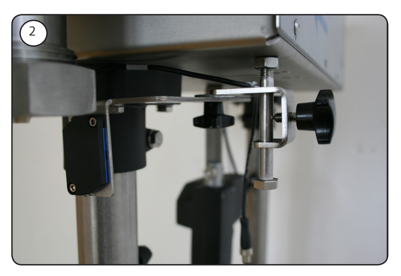
The bolt in the picture is scewed 5 mm up and the counter nut is tightened

Before use, please turn off table and filling machine. Mount the bracket with the bolt into the thread placed on the under side of the machine in the front. aproximatly where the arrow is pointing