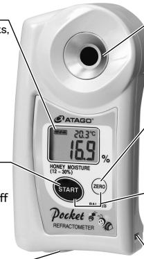
Image is for explanation purposes only. It may be different than the actual product purchased.