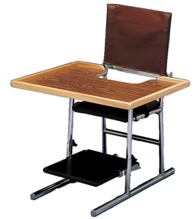
MODEL 154 W/ MODEL 123