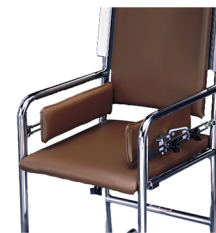
MODEL 1723 & 1724