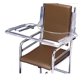
MODEL 1715 & 1716