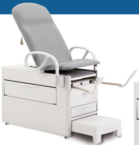
Standard top with patient assist handles, stirrups and pelvic tilt

An exam table as diverse as your patient population.