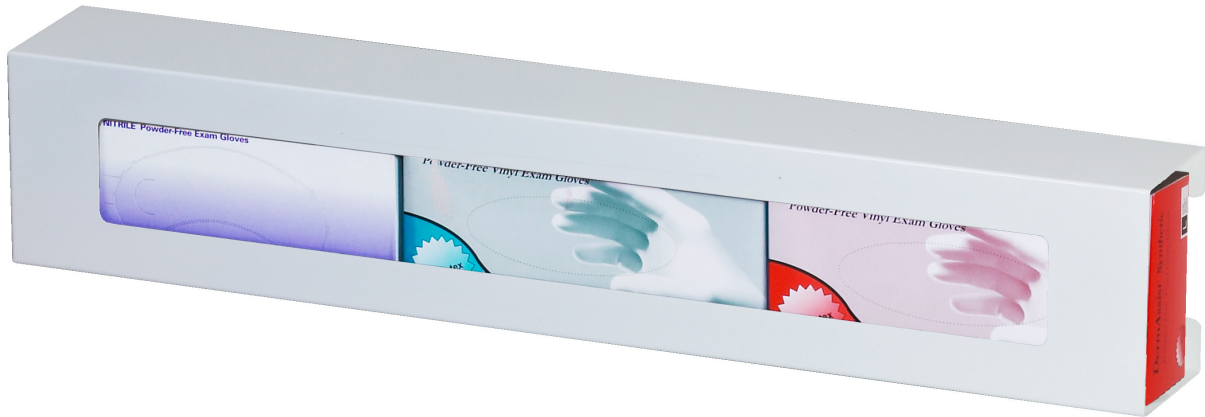
Shown in the horizontal position