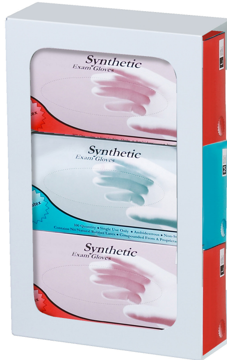
Shown in the vertical position