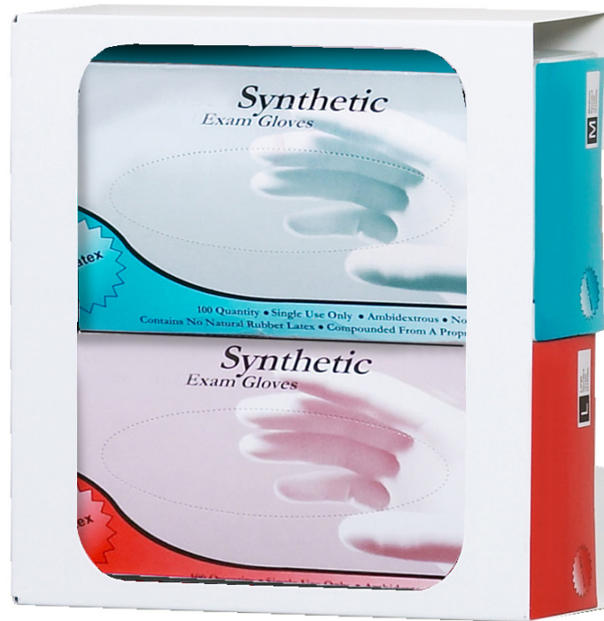
Shown in the vertical position