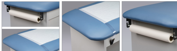
034- Paper Dispenser & Cutter Combo