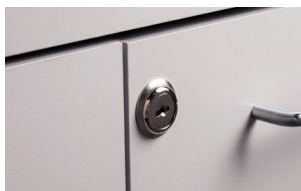
055 Door Lock