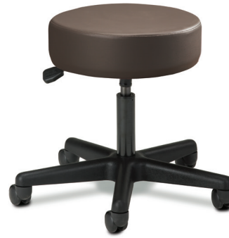
Prop 65 Warning

WARNING: This product can expose you to chemicals, including diisononyl phthalate (DINP), which is known to the State of California to cause cancer. For more information go to www.P65Warnings.ca.gov .