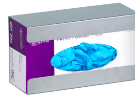
Shown in the horizontal position