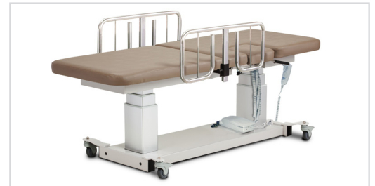
Optional Side Rails & Casters