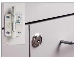
066 Door & Inside Latch Combo