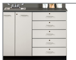
044 Add a Cabinet Drawer