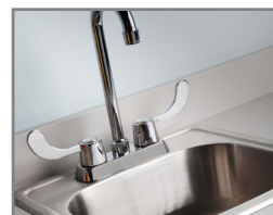
22 Sink & Faucet