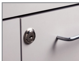
055 Door Locks