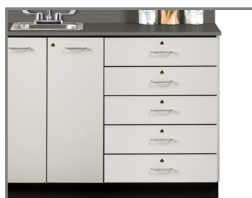
044 Add a Cabinet Drawer