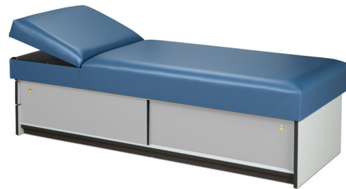
3770-16 Adjustable pillow wedge headrest