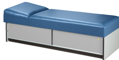
3770-10w/Non-Adjustable Pillow Wedge