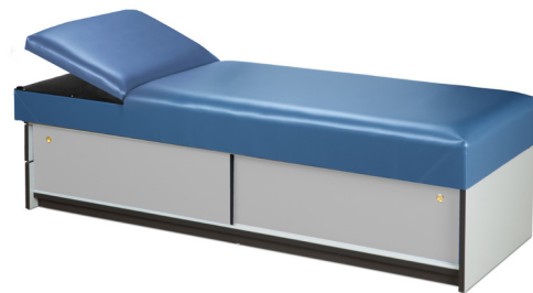
3770-15 w/Flat Foam Adjustable Headrest