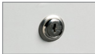
055 Door Locks