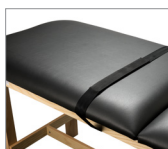
077- Safety Strap