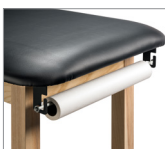
030- Paper Dispenser