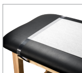
040- Paper Cutter