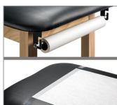
034- Paper Dispenser & Cutter Combo