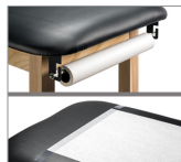
034–Paper Dispenser & Cutter Combo