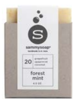
CANADA & USA