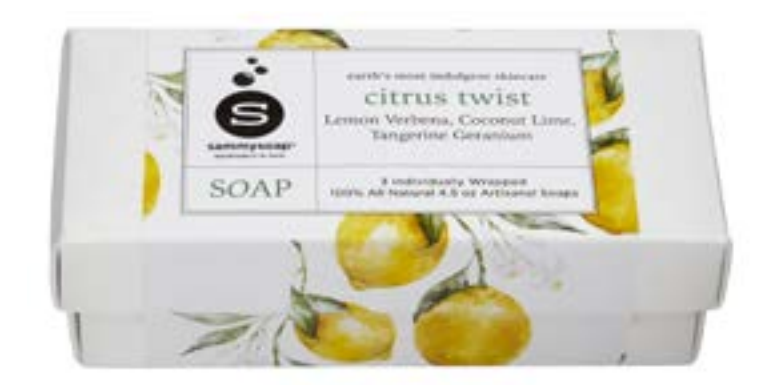
Make Lemonade Out of Lemons