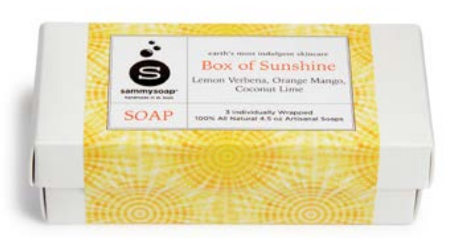
BOX OF SUNSHINE LEMON VERBENA ORANGE MANGO, COCONUT LIME