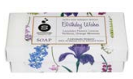
BIRTHDAY WISHES LAVENDER FLOWER LEMON VERBENA ORANGE BLOSSOM