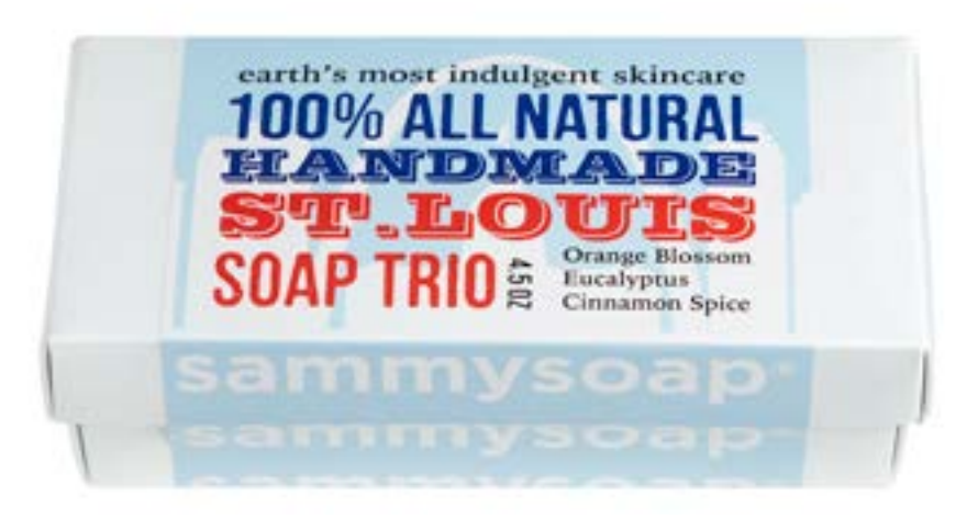
100% ALL NATURAL HANDMADE ST. LOUIS ORANGE BLOSSOM, EUCALYPTUS, CINNAMON SPICE