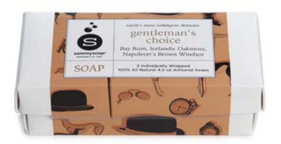
GENTLEMAN'S CHOICE ICELANDIC OAKMOSS, NAPOLEON'S BROWN WINDSOR, BAY RUM