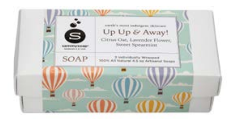
Kick Off Annual Sales Drives