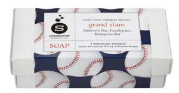
Hit Goals Out of the Park