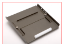
Flat Forming plate