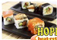
ASM835A--Maki Master Max.1200 rice mats/hr