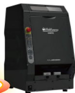
ASM410A--Nigiri Maker 2,400 rice balls/hr