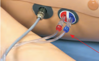
ILLUSTRATION OF INTERNAL PARTS AND THE OPTIONAL CONSOLE BOX CONNECTIONS