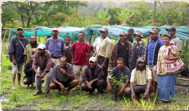
▲ Some members of the Korofeigu Farmer's Co-op

This mountainous region spans 275 acres, with loamy soil and native shade trees creating the perfect conditions for growing organic coffee. The Korofeigu Farmer's Co-op is comprised of 97 members, and links farmers to important resources that are helping improve the lives of those in their communities, from health education and support to gender equality initiatives and financial management.