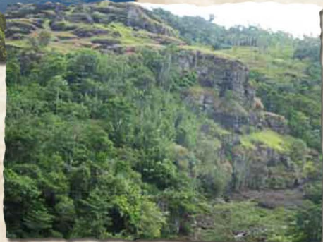
◀ Hagen Mountains, Papua New Guinea