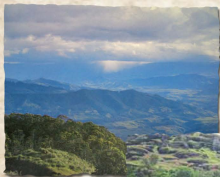
Lush shaded hillsides ▶

The initial reaction of the indigenous population was that of indifference; in a bountiful valley that could produce so much, it was thought that a crop that would take 3 years to harvest a return was a waste of time. However, from these small plantings in and around Korofeigu, coffee would grow to become the most important commodity in the development of the New Guinea Highlands. Today it is Papua New Guinea's most important agricultural crop, providing a major source of income for a third of the country's population.