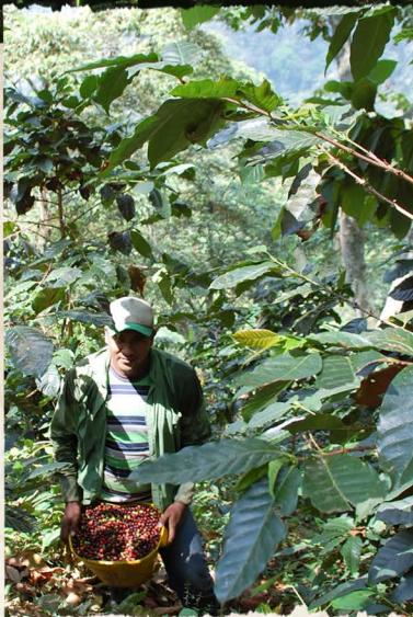
▲ Picking fresh cherries

Our Colombian coffee is sourced from Montesierra, a farmer group located in the Parque Nacional Sierra Nevada de Santa Marta in the northeast of Colombia. Montesierra organic coffee farms dot the mountainsides in this region of Colombia, overlooking the Caribbean Sea. Here, the mountains rise dramatically from a calm beach to rainforest conditions at ideal coffee elevation. Cloud cover over the mountain ridge captures moisture, producing high quality, large, rich coffee beans under rainforest shade. The coffee balances milk chocolate flavors with berry notes: a truly rich experience.