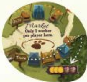
1 MARKET BOARD