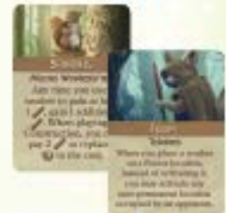
15 PLAYER POWER CARDS