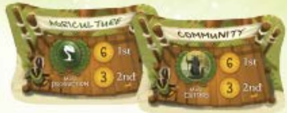
7 GARLAND AWARD TILES