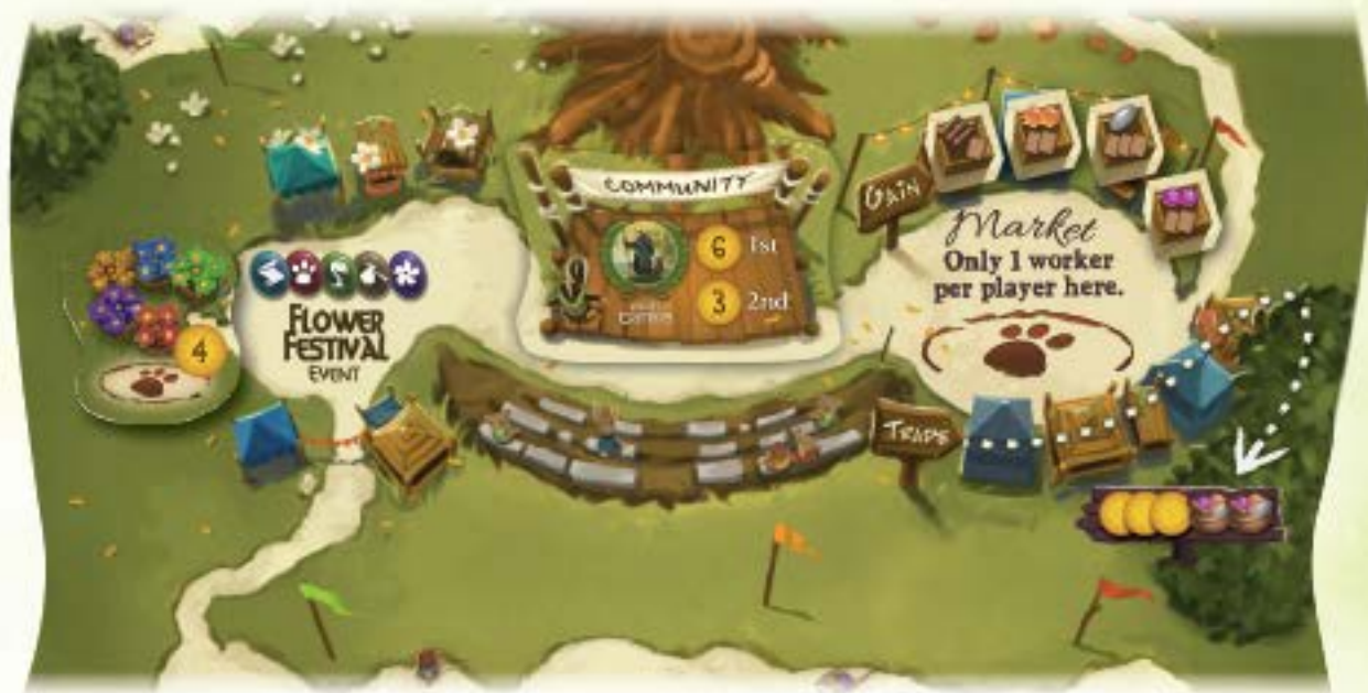
Bellfaire board set up to play with the Flower Festival, Garland Awards, and Market modules.

The Bellfaire board contains the Market location, and spaces for the Flower Festival Event and Garland Award tiles.