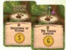
9 SPECIAL EVENT CARDS