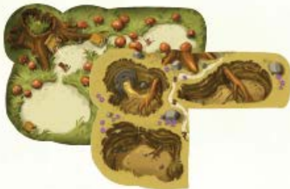
6 PLAYER BOARDS