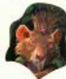
1 RUGWORT TOKEN