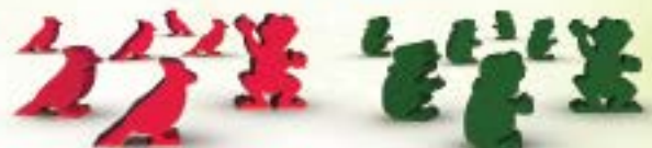
12 CRITTERS (6 CARDINALS, 6 TOADS) AND 2 FROG AMBASSADORS* *FOR USE WITH EVERDELL: PEARLBROOK