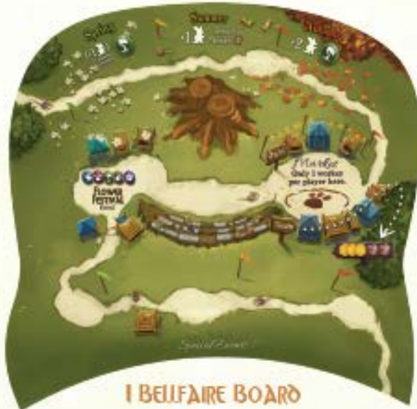
1 BELLEFAUR BOARD