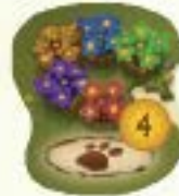
1 FLOWER FESTIVAL EVENT TILE