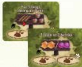
4 FOREST CARDS