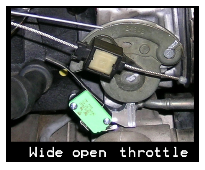
Step 4: After installation is complete, have a friend push the gas pedal to wide-open throttle. The throttle cam should come into contact with the switch arm right before full throttle is achieved. If the throttle cam makes contact with the arm but does not close the switch contacts at wide open throttle, simply tweak or adjust the arm so it does.

Wide open throttle switch contacts are closed, properly adjusted.