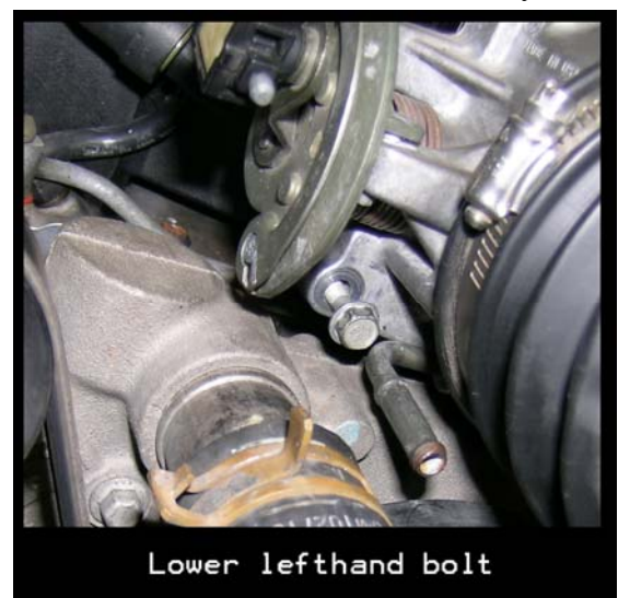
Step 1: Remove the lower passenger side throttle body bolt using your 10mm wrench or socket/ratchet.