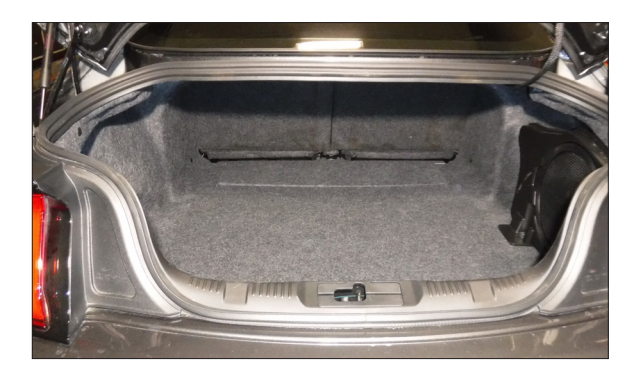
Step 1: Open the trunk and remove the floor panel.