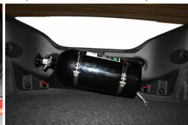
(Installed in the trunk)