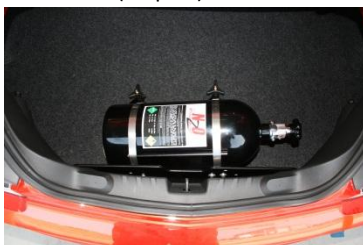
(Install from outside the trunk)