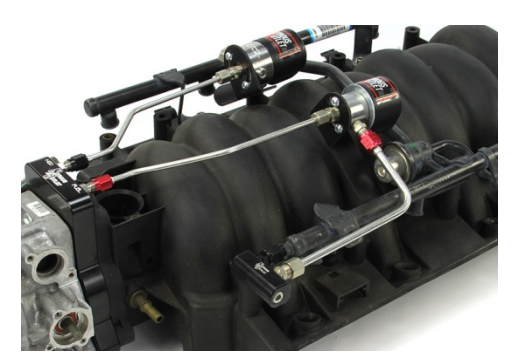
78mm FBody/GTO/Corvette plate fittings face back toward the firewall

Step 7 If your car uses a throttle cable you will now need to unbolt the two bolts that hold the throttle cable bracket to your intake. Using the supplied extension bracket, line the counter sunk holes up with the bolt holes on the intake bolt the extension bracket to the intake. Now you will see that there are two holes in the extension bracket. These two holes would be towards the front of the car. Bolt your factory throttle cable bracket to the extension bracket using the supplied bolts. Reconnect the throttle cable to the throttle body pivot arm.