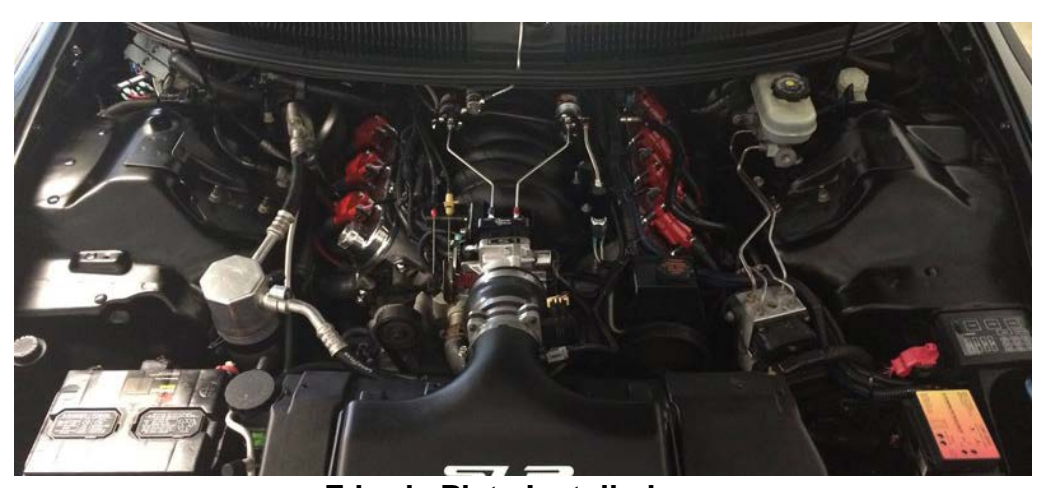
F-body Plate Installed

Step 12 If your bottle is in the trunk you can run the main feed line under the car to the trunk, its best to run the feed line with the stock fuel line. You will need to drill a hole in the bottom of the trunk to route the line into the trunk. If your bottle is in cab run the nitrous line through the firewall.