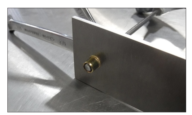
Step 4: Un-thread the ½-20 bolt with the nuts to complete the install.