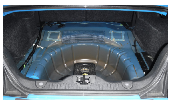
Step 2: Remove the floor/spare tire cover.