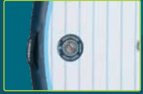
iLAND™ LIG x iR Round Dock 12 PSI (0.83 BAR) — 16 PSI (1.10 BAR)