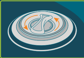
AIR VALVE CAP