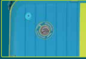
iLAND™ by iROCKER Square Dock 14 PSI (0.97 BAR) — 18 PSI (1.24 BAR)