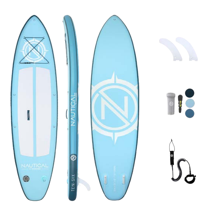
WHAT'S IN THE BOX?