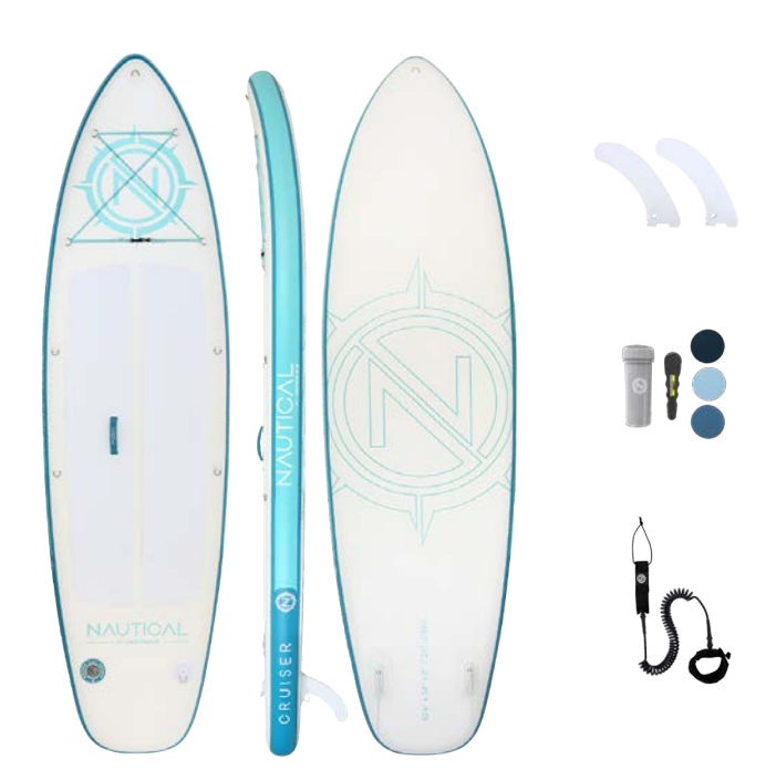
WHAT'S IN THE BOX?