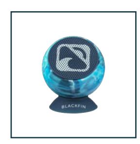
VIBE 2.0 SPEAKER

Paddling is better together! Grab a friend and these fun accessories for a memorable time on the water.