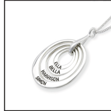
Ubercircles / Uberovals Extra small, small, med, large

REMEMBER! Write using a MEDIUM pen and stay within the box