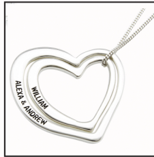
FOREVER HEART Extra Large / Large

Use this page for the following Your Script pieces: