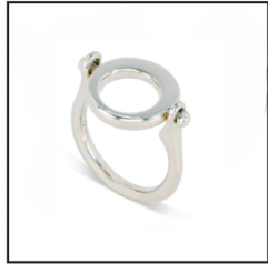
Signature Swivel Ring

Use this page for the following Your Script pieces: