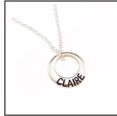
Extra Small Ubercircle

REMEMBER! Write using a MEDIUM pen and stay within the box