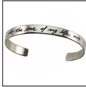
Expression Cuff Narrow

Use this page for the following Your Script pieces: