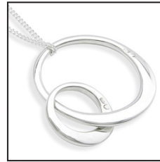
Mother and Child Pendant