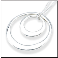
Ubercircle small and large

Use this page for the following Your Script pieces: