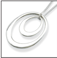
Uberoval small and large