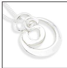
Infinity Pendant small and large