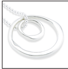
Living circles small and large