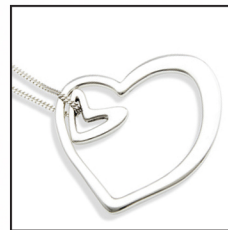
Forever Heart small and large

REMEMBER! Write using a MEDIUM pen and stay within the box