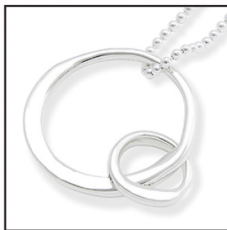
Mother and Child Living