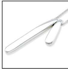
Love Lines small and large