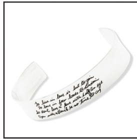
Expression Cuff Medium

Use this page for the following Your Script pieces: