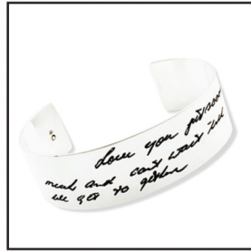
Expression Cuff Wide

Use this page for the following Your Script pieces: