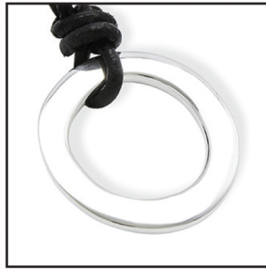
Mini Original Pendant

Use this page for the following Your Script piece: