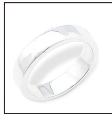
Love Band Ring