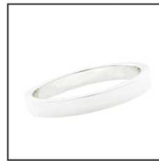
Love Band Ring Narrow

REMEMBER! Write using a MEDIUM pen and stay within the box