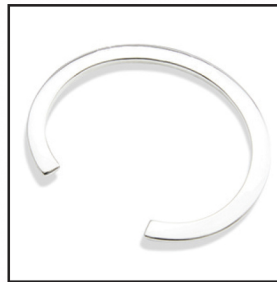
Expression Cuff Flat

REMEMBER! Write using a MEDIUM pen and stay within the box