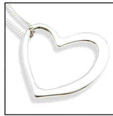
Forever Heart Extra Large

REMEMBER! Write using a MEDIUM pen and stay within the box