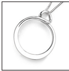
Infinity Pendant Extra Large

Use this page for the following Your Script pieces: