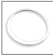
My First ID Bangle