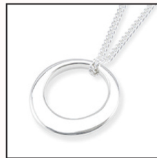
My First Ubercircle small