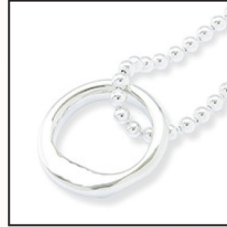
Living Circle small