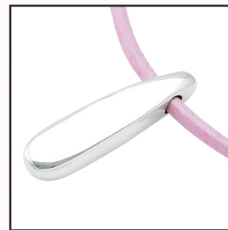
Girls Love Lines small