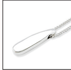
Small Love Line