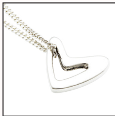
Forever Heart small