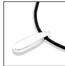
Boys love Lines small

REMEMBER! Write using a MEDIUM pen and stay within the box