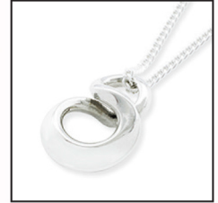
Infinity Pendant small